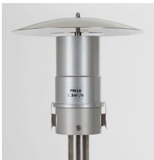
PM10 inlet head

SM200 analyser unit equipped with the TS200, which is used for keeping the sample air at ambient temperature. The TS200 includes an inlet tube, ventilation hose, drain hose, fan and flanges.