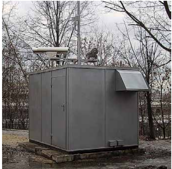
An Opsis system, mounted on a specially designed moveable container, monitoring the release of air pollutants at street level

Each measurement result includes not only information on concentration but also on standard deviation and light level. Altogether, this provides the possibility of comprehensive and thorough analysis and evaluation of the data.