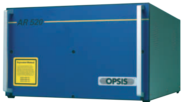
The Opsi analyser, including analyser software