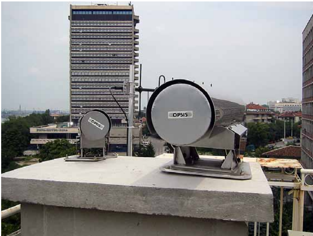
An Opsis installation at roof-top level

Opsis is specialized in the development, manufacture and marketing of high-quality systems for air quality monitoring. The importance of finding user-defined solutions to measurement problems is always being emphasized. Opsis systems are today in operation all around the world.