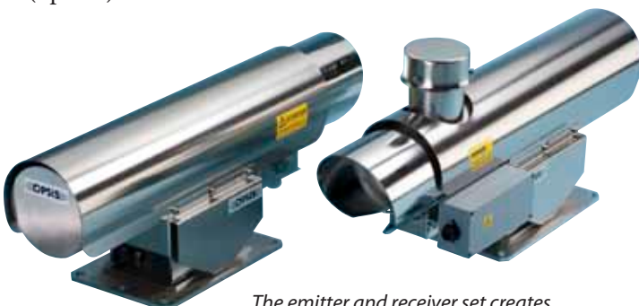
The emitter and receiver set creates the monitoring path